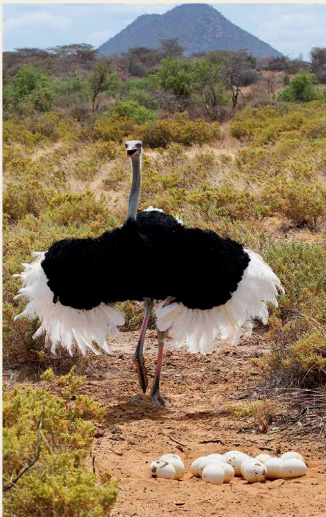
Photograph on page 126 courtesy of the Naankuse Foundation • Naankuse.com