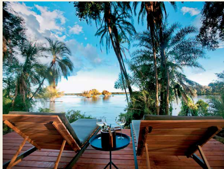
Thorntree River Lodge