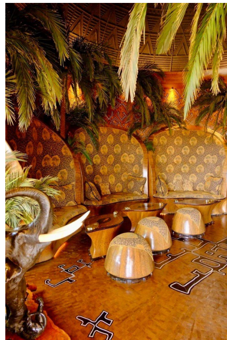
At Ol Jogi, a lavish private retreat in Kenya's Laikipia region, 1970s glamour meets the spirit of an African safari—a nexus of chic and timeless elegance for design enthusiasts.

Undeniably, Nairobi, and perhaps Kenya as a whole, is teetering on the brink of achieving extraordinary artistic and cultural feats. It has become a place where these elements not only enhance the landscape but define it. As Pinto aptly puts it, "We introduce our guests to local artisans not just to support the community, but because these artists spin the most compelling tales." Across Kenya, these narratives are just starting to unfold for those eager to embark on a life-enriching artistic journey.