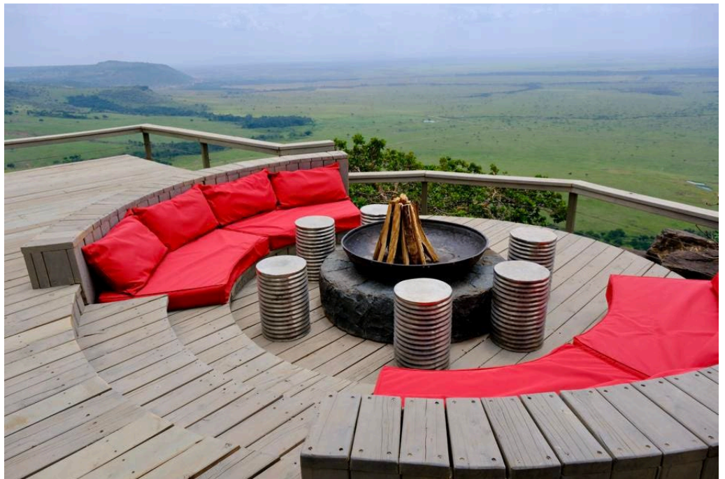
A wild ride of design innovation unfolds at Angama Mara, where architects and designers push boundaries, creating a safari lodge that breaks the mold.

Over recent decades, Nairobi has evolved from an overlooked dot on the global cultural map to a radiant beacon of artistic expression and design ingenuity.