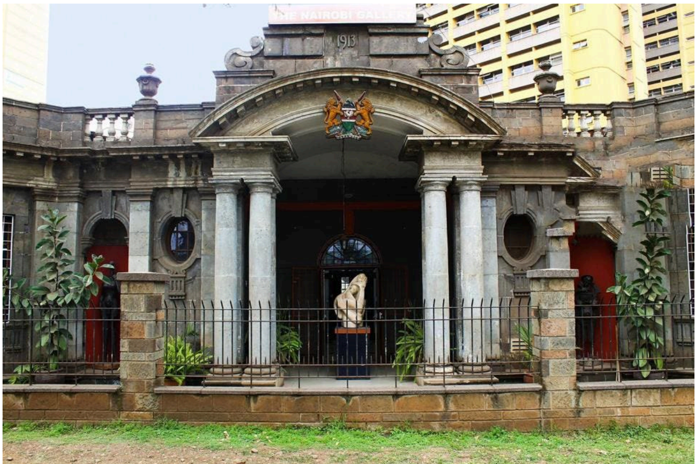
The Nairobi Gallery, with its stone-embellished Victorian exterior and stunning octagonal dome hall, stands as the city’s architectural gem.

“Micato’s East Africa CEO, an avid African art collector, leverages his insider access to premier galleries and artists, enabling us to orchestrate exclusive art experiences and private curator meetings,” adds Pinto. “Our Safari Directors, well-versed in the East African art scene, further enrich these experiences for our art-loving guests.” The One Off Contemporary Art Gallery perfectly showcases the city’s artistic vitality by heavily featuring local talent (“Even a quick stroll in the sculpture garden feels good for the soul,” adds Pinto). Then there’s the Circle Art Gallery, which also spotlights contemporary East African art (for both established and emerging artists), and the Nairobi Gallery, home to the vast Murumbi Collection that bridges the gap between the city’s glorious past and its current artistic wavelength.