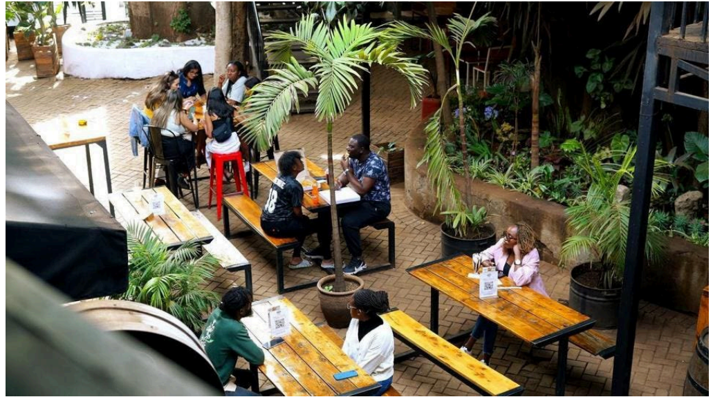
The Alchemist is a creative hub where fashion shows, open mic nights, and an impressive selection of cocktails come together for an unforgettable experience.

Take, for instance, Talisman. This restaurant isn't merely a place to dine; it's a temporal portal, marrying the city's colonial past with its pulsating present. Here, amid oriental rugs and warming fireplaces, one can relish a globally influenced fusion menu teeming with South Asian nuances. The fusion of feta and coriander in their samosas proves to be a revelation, while the slow-cooked braised pork belly, accompanied by house-made mustard, elevates the culinary craft to art. And for a denouement? A lavender ice cream that echoes the freshness of a summer day.