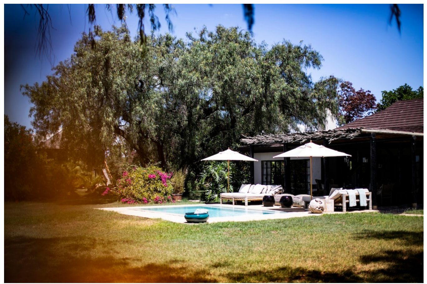
With three bedrooms and a private pool, Segera's Farmhouse is perfect for families.

Opened in 2013, Segera is an emerald oasis in a 50,000-acre golden savannah, and just a 10-minute flight southwest from Ol Jogi. Crosshatched with brick paths and bursting with soaring candelabra trees and bougainvillea blossoms, the lushly landscaped grounds form a radiant backdrop for show-stopping sculptures displayed throughout. The works belong to the largest private collection of contemporary African art in existence, amassed by Segera owner and current Harley Davidson CEO, Jochen Zeitz.