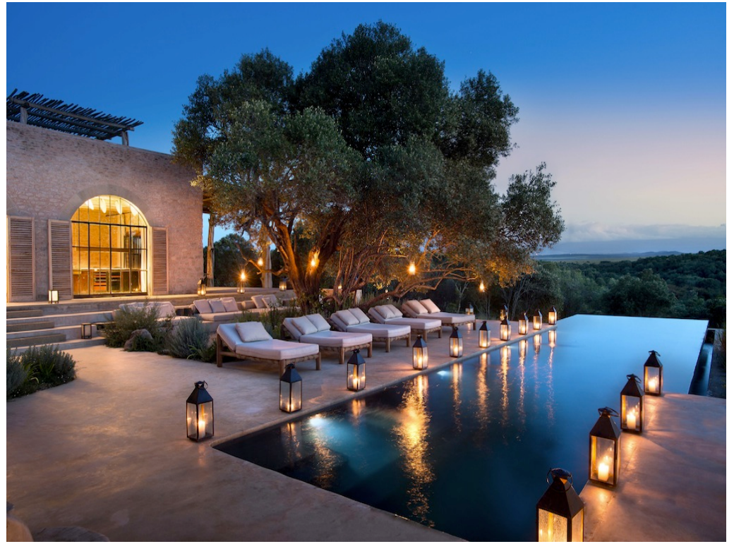
A 400-year-old wild olive tree enjoys pride of place by Arijiju's infinity pool.

The jeep grinds to a halt as we spot a massive white rhino 10 yards to our left. Raising his huge head from the grass, he eyes us warily and edges closer, relying on his keen sense of smell and