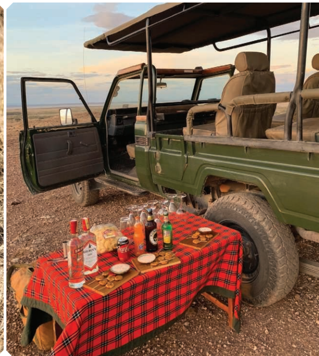
Scenes from a safari: Lions on the prowl and (right) a sundowner setup in Amboseli. Opposite: Maasai warriors demonstrate the adumu , their renowned jumping dance.