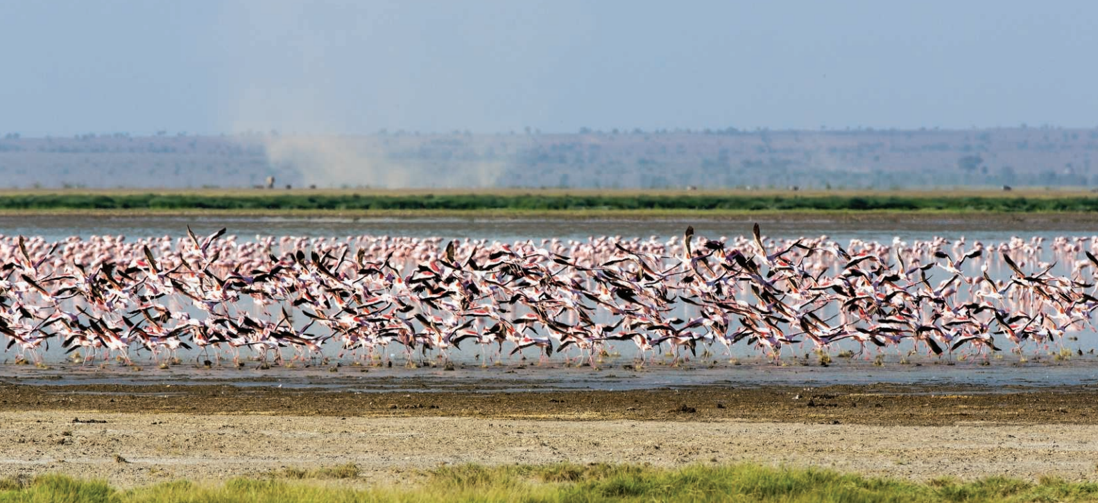
Above: Flamingos take flight in Amboseli.

roaring territorial scuffle between lions from two different prides that sent a tiny cub scampering into a ravine as one lion chased off two others. Distressed, we worried about the cub's fate. Though we never saw the cub that afternoon, we watched the older lions of one pride reunite, clearly happy to see each other as they rubbed their faces together and intertwined their bodies and tails the way housecats would. That feel-good moment was interrupted, however, when they became aware of our presence and stalked toward our open-air vehicle to investigate. Five interested lions suddenly surrounded us, so close they could jump into our car. None of us moved. After a tense minute or so they retreated, and we let out a collective (and silent) sigh of relief.