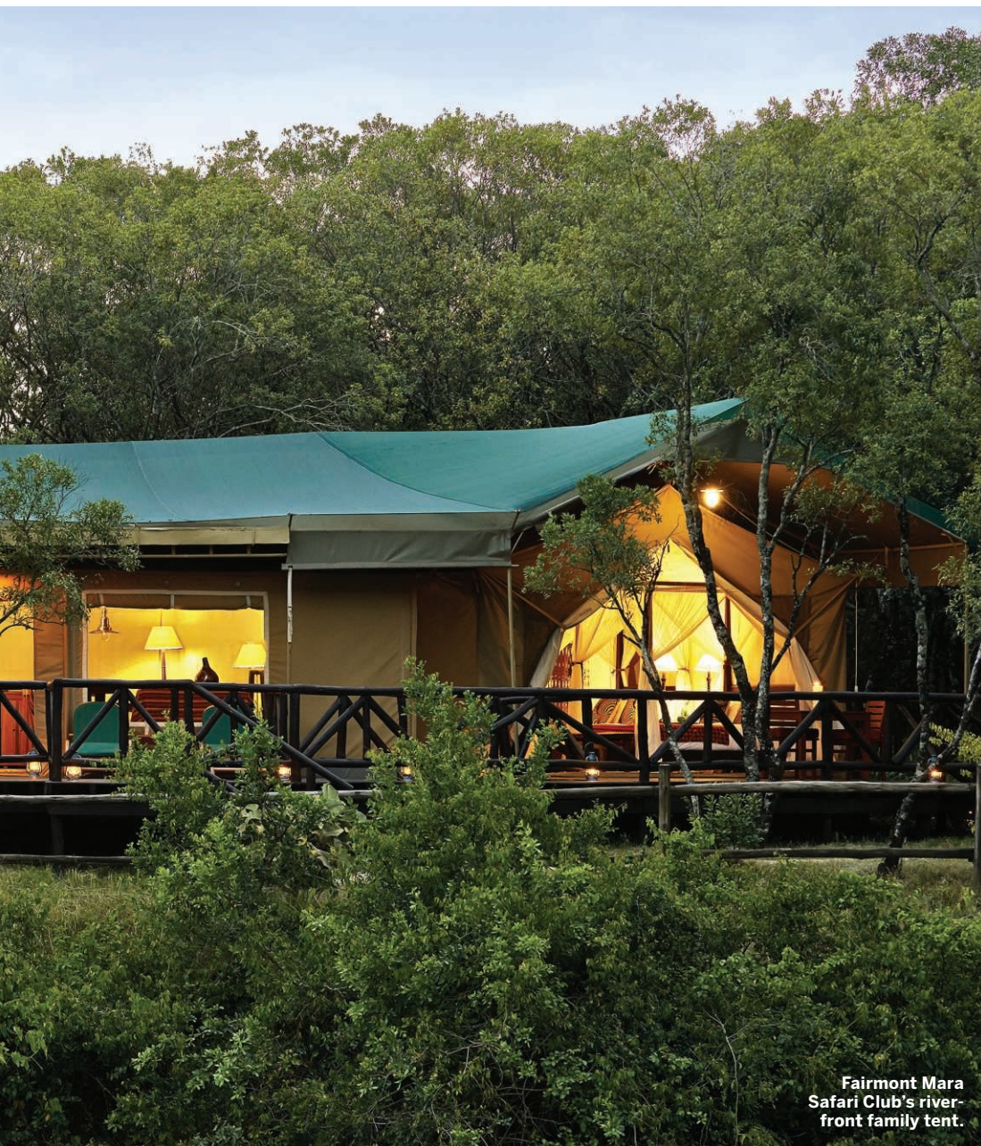
Fairmont Mara Safari Club's riverfront family tent.

multiple lodges across great distances), a safari isn't a do-it-yourself endeavor, so we tapped our Virtuoso connections to ensure we did it right. All outfitters in the Virtuoso network have been vetted, and we went with Micato Safaris, a family-run company with 50-plus years of experience and plenty of awards to prove it.