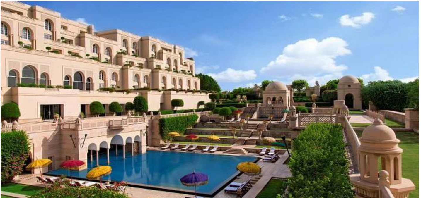
The spectacular Oberoi Amarvilas in Agra OBEROI HOTELS

Most tour operators will have you visit the Mehtab Bagh – a site across the river for a sunset view of the Taj Mahal but I suggest you wait until you can get the ultimate wow factor at the main entrance. You don't want to see such a majestic monument from a dirty, crowded vantage point as this filled with selfie-stick day trippers.