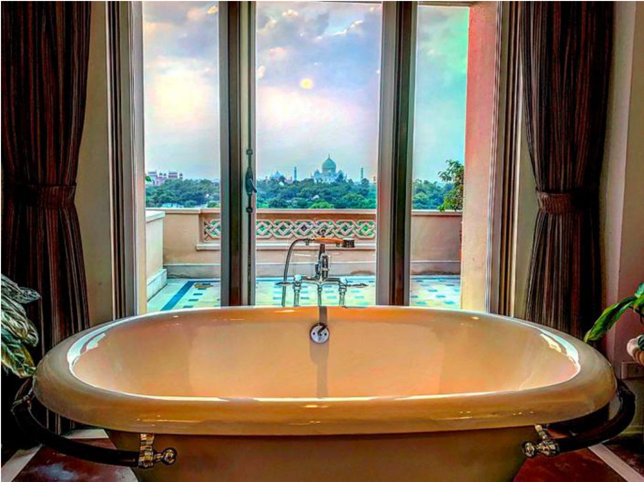
Bathtub view from the Kohinoor Suite at Oberoi Amarvilas JIM DOBSON

The resort itself is a remarkably tranquil retreat designed throughout with Mughal style frescoes painted in gold leaf and resembling a palace from centuries ago. The courtyards are filled with fountains and pools while chandeliers and lush furnishing add to the opulence and celebrating Indian craftsmanship. A day visit to the Amarvilas Spa is the perfect way to unwind when you arrive with their mosaic lined whirlpool tubs and Ayurvedic treatments.