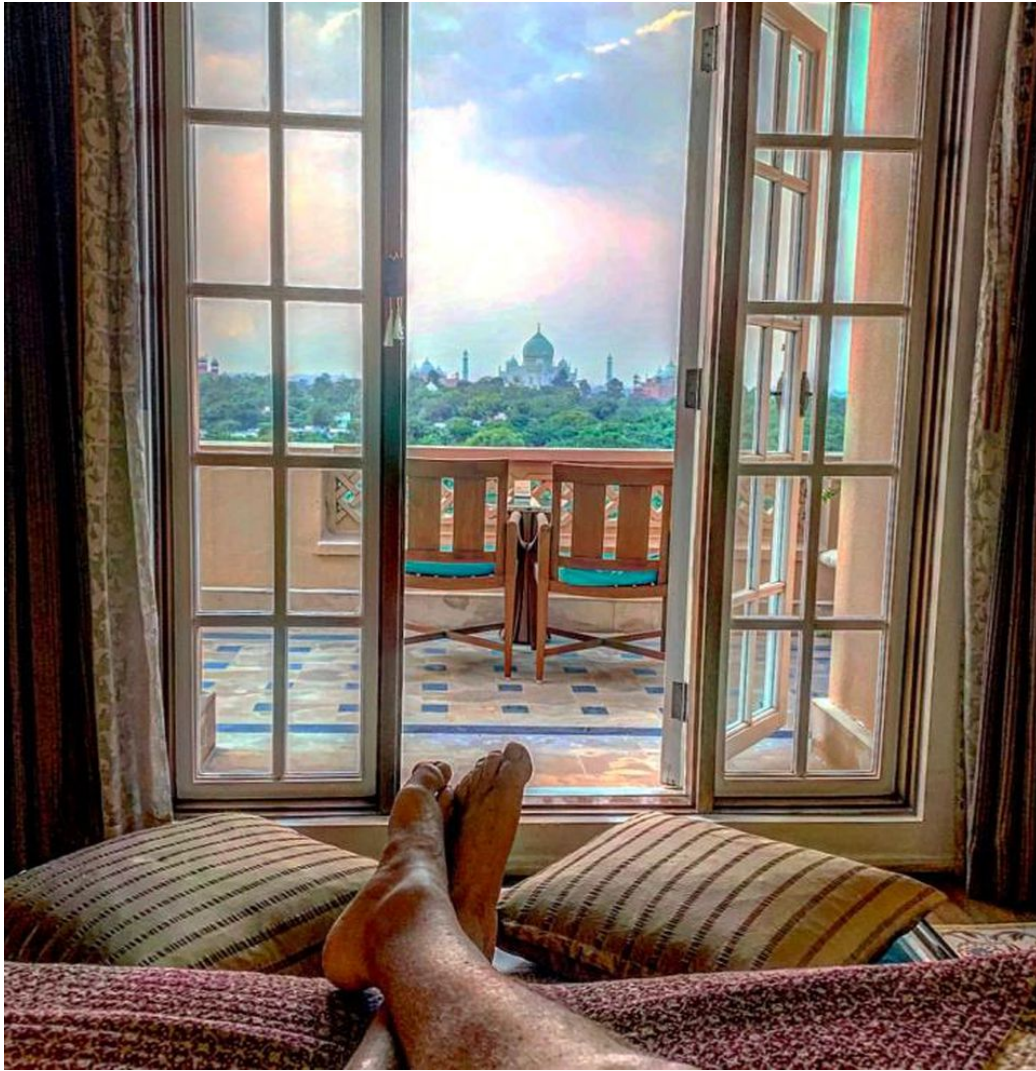
Bedroom view from the Oberoi Amarvilas JIM DOBSON

I only had time for a brief visit to Agra so I wanted to make sure every moment was magical. My dinner that night was poolside under the stars along with the resorts charming young GM Vishal Pathak. We were entertained by a special classical dance performance overlooking the carved sandstone regal pavilions, while the Moorish architecture reflected in the pools.