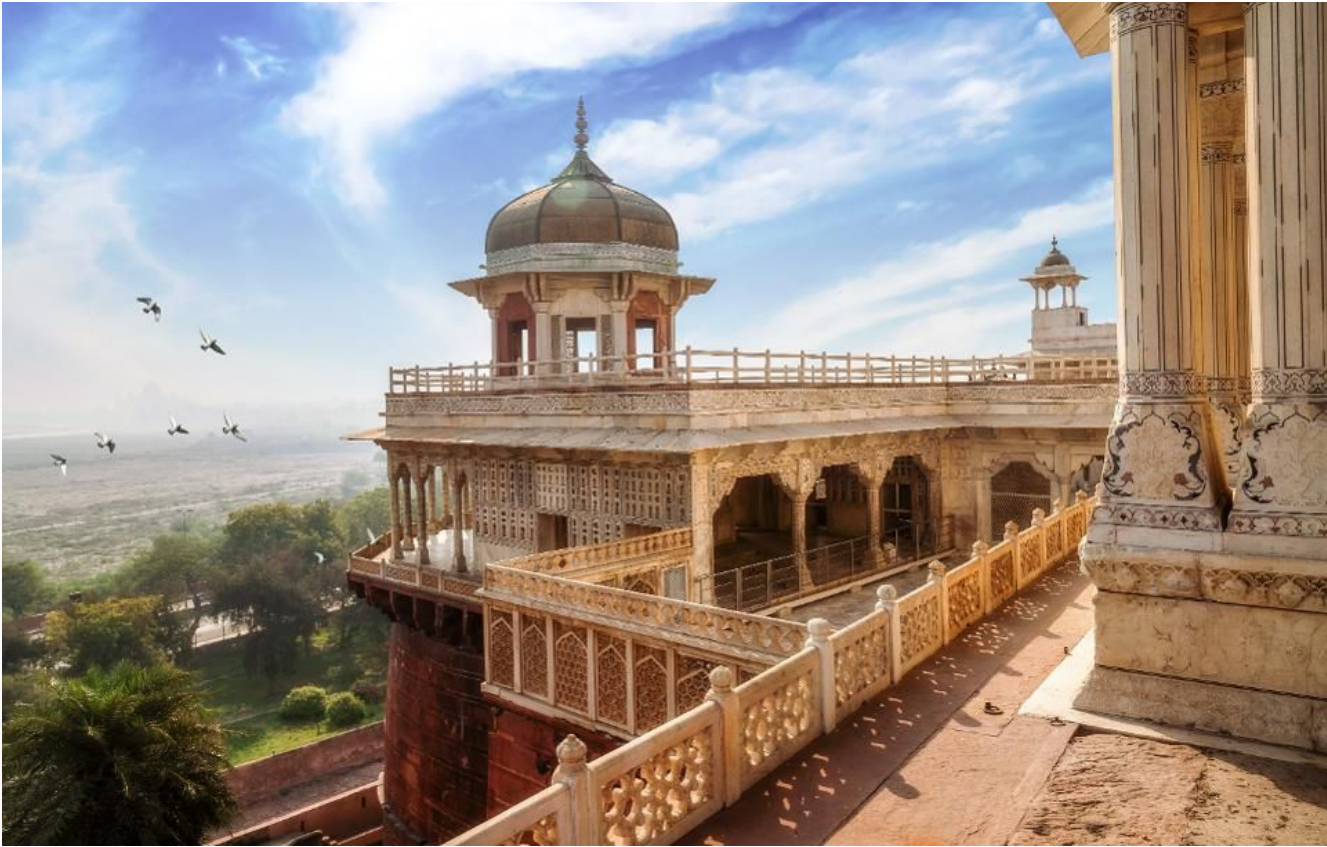
Red Fort in Agra overlooking the Taj Mahal where Shah Jahan was imprisoned

In 1631 the queen died during giving birth to their fourteenth child. Before she died, the Shah promised to build her the most beautiful mausoleum in the world. But in a twist of fate just as Shah Jahan had once conspired against his brothers for the empire, his son Aurangzeb overtook the throne. In 1658, Aurangzeb declared himself emperor and imprisoned his father in a tower of the Red Fort in Agra. For the man who once held the wealth of an empire, he was forced to view the Taj Mahal from his prison tower. After the British discovered the site in the late 18th century the Taj Mahal became the ultimate place to visit for every traveler to India. Today the Taj Mahal attracts over 8 million tourists annually with most of them visiting during the cooler months of October, November, and February.