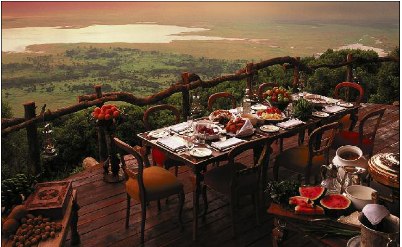
BREAKFAST AT NGORONGORO CRATER LODGE

Amboseli is big game country: elephant, antelope, zebra, wildebeest, buffalo and giraffe. Two game runs are planned today, both which will introduce you to the