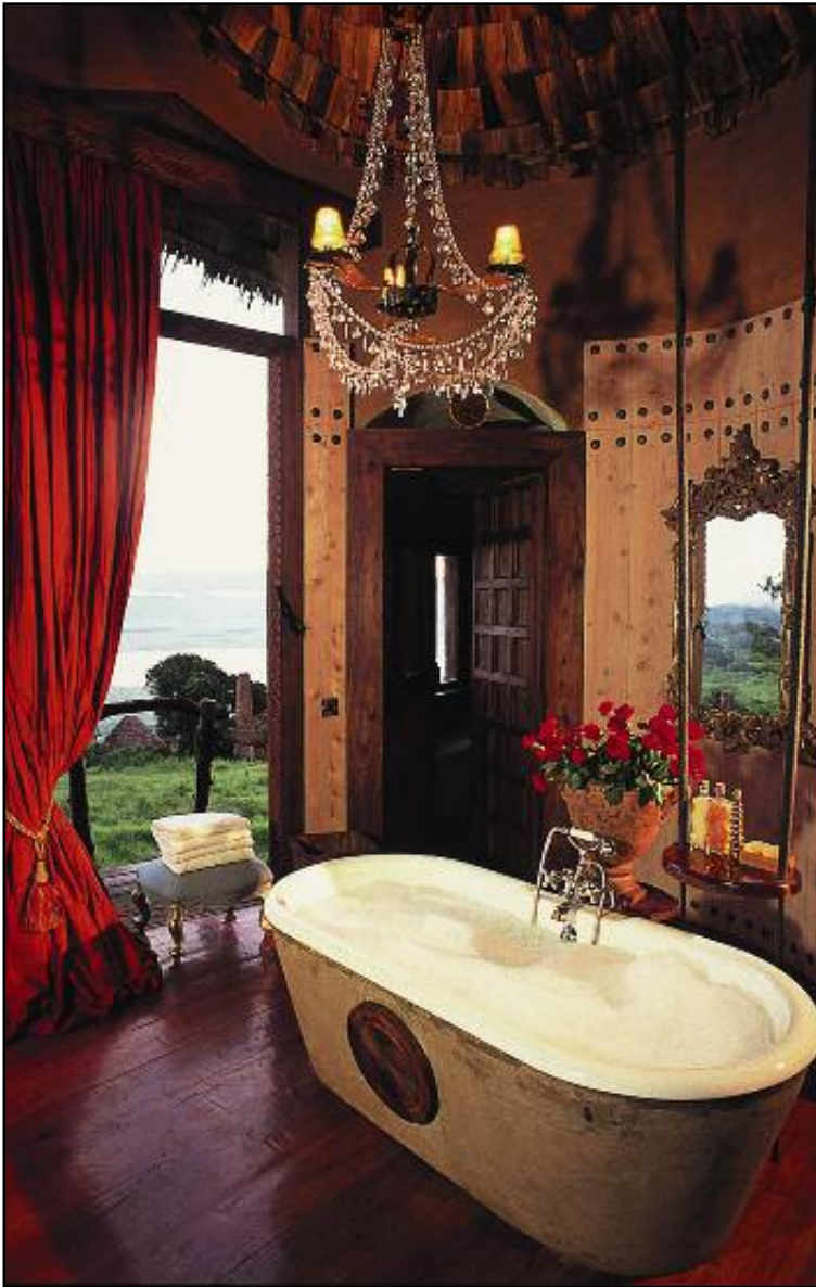
NGORONGORO CRATER LODGE