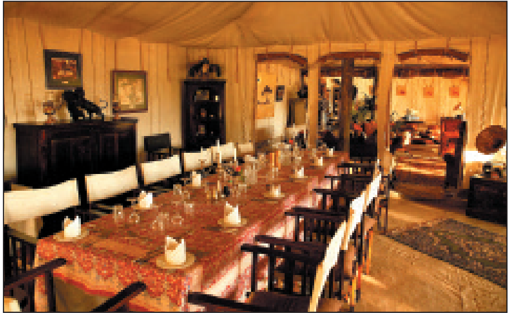
COTTAR'S 1920 CAMP

new heights. Located at the edge of a towering escarpment in a secluded glade, Losiaba was built originally as the Kenyan home of the late Italian Count Ancilotto, who transformed its 60,000 acres from a failing cattle ranch to a successful enterprise in alternative land use—and in the process, created a wilderness paradise for a very privileged few to share. His home, occasionally available for private groups, is divine (Italian nobles have exquisite taste!), and his delightful lodge offers diversions beyond our wildest imagination. Micro-light flying anyone? Or perhaps quad biking across the escarpment, rafting the